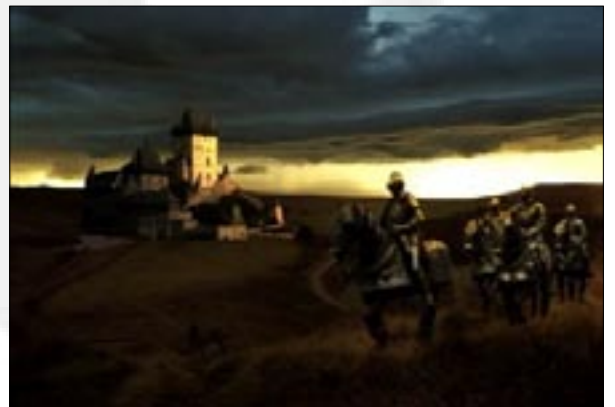
March 2006 Featured artist: Christopher Artist's quote: "A patrol of vassal knights makes one last circuit of their lord's castle before nightfall..."