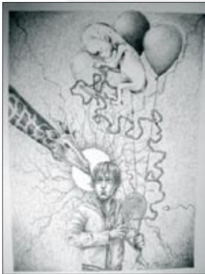
December 2005 Featured artist: Cody Schibi Artist's quote: "...we all have them."

As I've made the decision to move VooDooNews to a quarterly, rather than monthly publishing schedule, I'm introducing this page. " Credit Where Credit Is Due " will take up the slack on the images that could not make the VooDooNews cover for no other reasons than timing & tides.