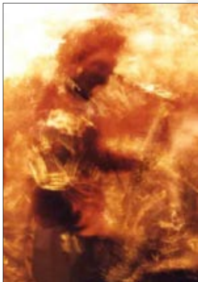
January 2006 Featured artist: fester aka Artist's quote: » The Thames carnival, London. Like so many of my images I have embraced the impressionist ideas of colour and blur... ... A saxophone player swinging the beat in front of his swaying dressed like-wise band. It's all about energy, flow and movement..."